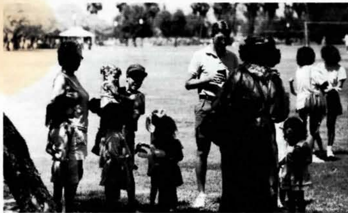
The clown was a big hit with all the children.